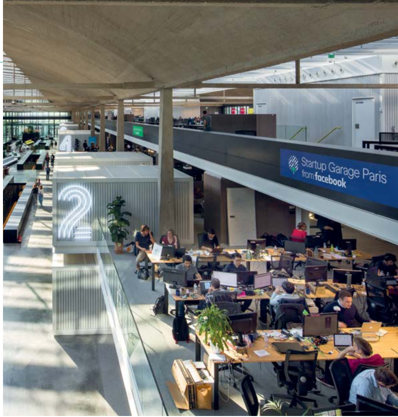
Station F Create Zone