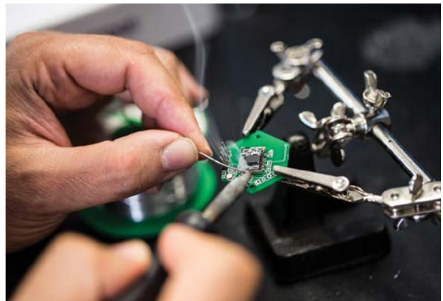
Start-up Ubique / Ali AZADI © École polytechnique - J.Barande

Source: Insee 12/18, data 2015 - Total population 15-64 years