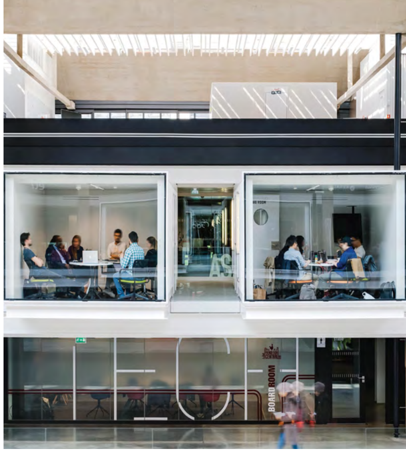
Station F Insead

88% jobs in services 7% in industry 4.9% in construction 0.1% in agriculture Insee, 1/20, data 2018