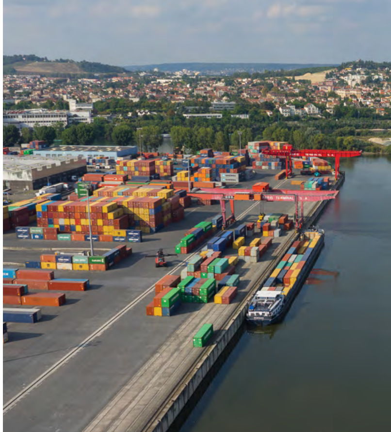
Port of Gennevilliers

Paris Region sits at the geographic heart of Europe. An outstanding transport and telecommunications infrastructure connects the French capital to all of the world's major economic regions. Paris Region benefits from a catchment area with an estimated 25 million inhabitants within a 200-kilometre radius. Paris Region is an ideal hub for logistics and shipping, with very efficient infrastructure to get your goods to market.