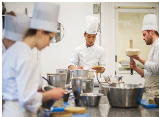
Ferrandi School