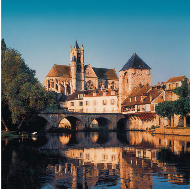
Moret-sur-Loing

Life in Paris Region offers something for everyone. There's a reason why Paris Region is the #1 destination on the planet: with 50 million visitors each year, the area is synonymous with "art de vivre", culture, gastronomy and history. Leisure and entertainment options in the Region are practically unlimited - cinemas, shows, theaters, concerts, operas, shopping at its best, gourmet restaurants, cafés, sports clubs, sport events and more... The Region is also committed to improving the environment, preserving biodiversity and reducing carbon emissions.