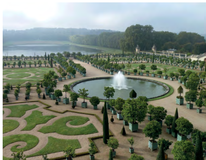
Versailles - The Gardens