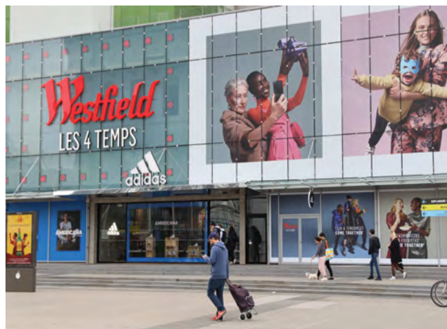
Westfield Les 4 Temps La Défense business district

Sites commerciaux n°291, September 2019, Panorama/tradedimensions, Le guide 2019 de la distribution and L'Institut Paris Region