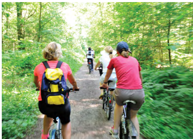
Ride in Saint-Germain-en-Laye forest

The Paris Region is a popular setting for French and international films.