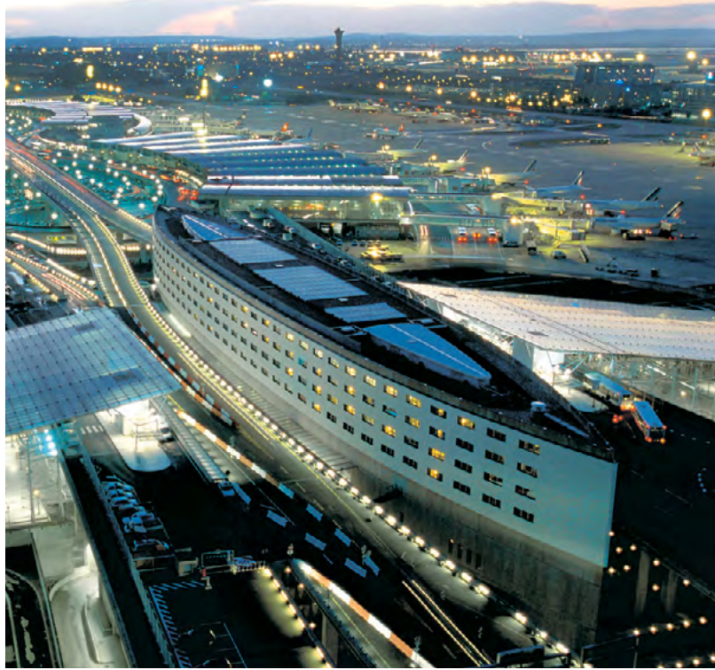
Paris CDG Airport