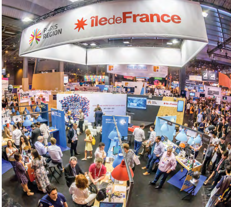
Vivatech © Jean-Claude Guilloux. Vivatech