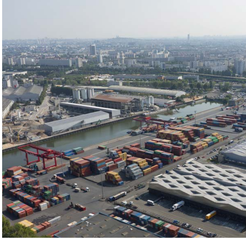
Port de Gennevilliers

Paris Region sits at the geographic heart of Europe. An outstanding transport and telecommunications infrastructure connects the French capital to all of the world's major economic regions. Paris Region benefits from a catchment area with an estimated 25 million inhabitants within a 200-kilometer radius. Paris Region is an ideal hub for logistics and shipping, with very efficient infrastructure to get your goods to market. Due to the rapid expansion of e-commerce in Paris Region, the logistics industry is facing numerous challenges: faster delivery times, the need to shorten the distance between warehouses and end-users, finding available land and warehouses... Innovative businesses are therefore very attractive to key logistics players in Paris Region.