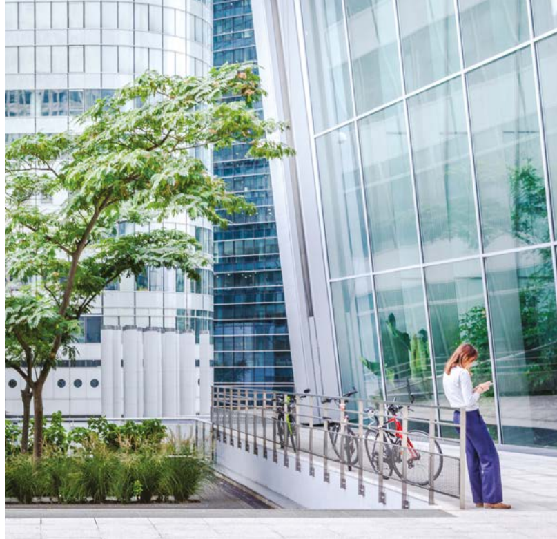
La Défense Business District

The new normal of working from home is pushing companies to rethink the traditional office model. The sharing of workspaces could become increasingly common. The rise of coworking, especially in third-party locations, should accelerate if companies allow remote working in these shared spaces.