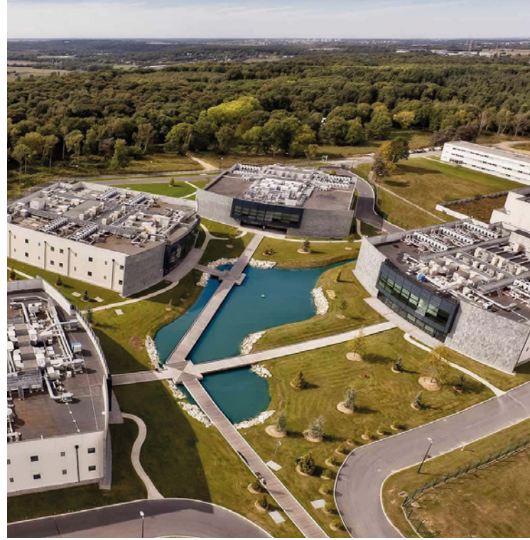
Marcoussis (Essonne, 91)

The Region has a dense data center and telecom infrastructure, making it the 4 th densest region in this sector in Europe.