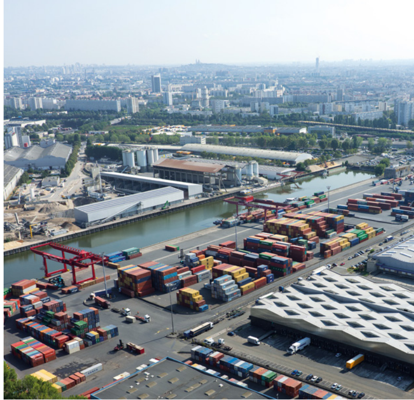
Port de Gennevilliers

Due to the rapid expansion of e-commerce in the region, the logistics industry is searching for numerous solutions: faster delivery times, the need to shorten the distance between warehouses and end-users, finding available land and warehouses. Innovative businesses are therefore very attractive to key logistics players.