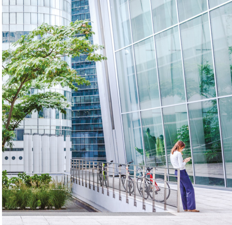
La Défense Business District

With a real estate market offering of 55 million m 2 , Paris Region is a constellation of diverse, specialized districts that make it a highly attractive location for a range of industries, research areas, and lifestyles. The real estate market has recently transformed as companies rethink the traditional office model in favor of more flexible options and third-party locations. Home to a variety of coworking spaces and the world's biggest startup campus, Paris Region real estate offers an ecosystem of collaboration and true business synergy.